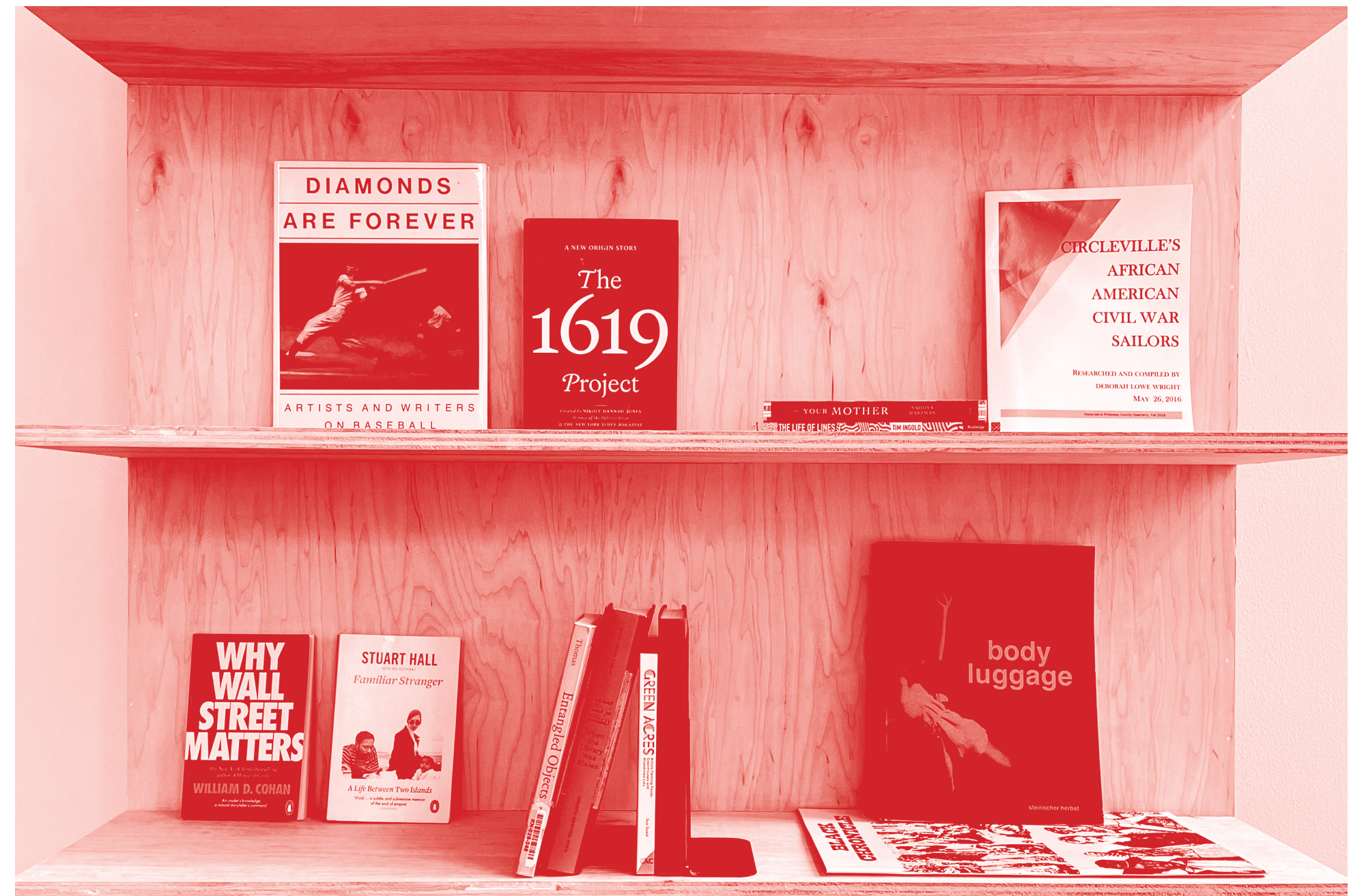
C& Center of Unfinished Business (detail), Contemporary Arts Center, Cincinnati, May 8-September 11, 2022.

The VLO Fellows Library is a collection of publications by each of the forty-four fellows the Vera List Center has hosted over its thirty-year history and counting. It celebrates and makes available the rigorous research and wide-ranging work of the Center's fellows.