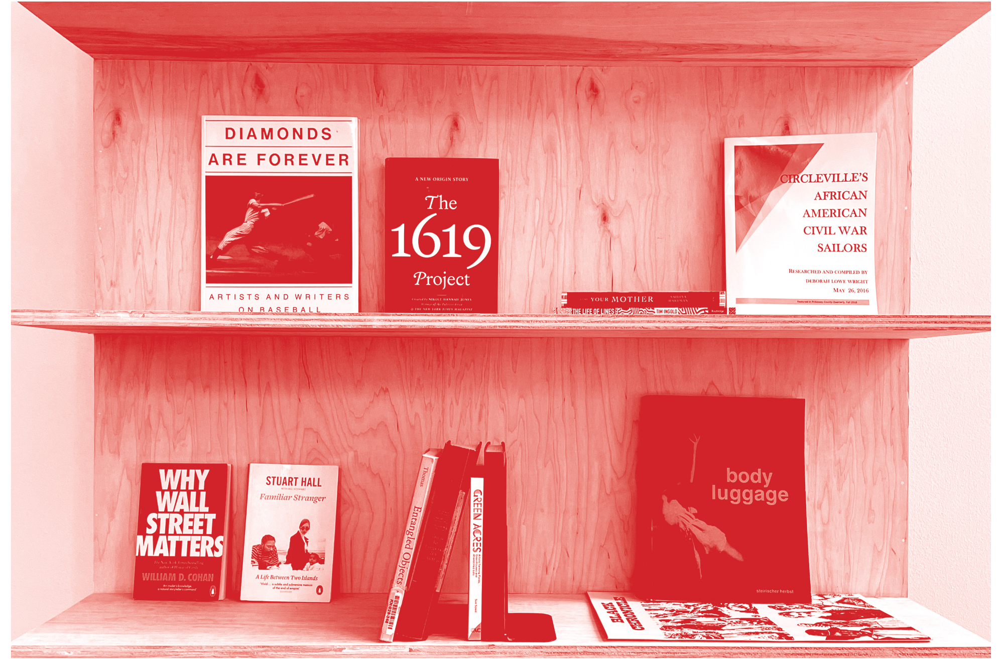
C& Center of Unfinished Business (detail), Contemporary Arts Center, Cincinnati, May 8-September 11, 2022.

The VLO Fellows Library is a collection of publications by each of the forty-four fellows the Vera List Center has hosted over its thirty-year history and counting. It celebrates and makes available the rigorous research and wide-ranging work of the Center's fellows.